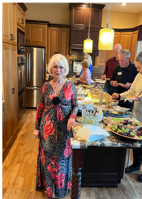
Our March Wine and Friends Hostess