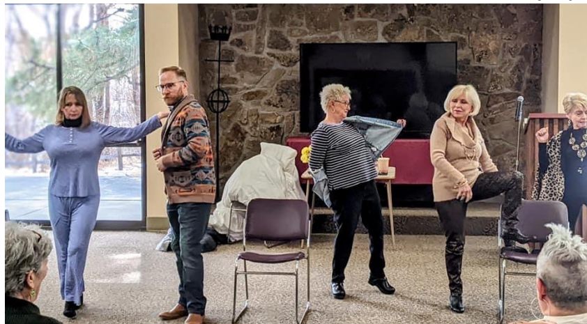
The entertainment is just getting started with this drama game!