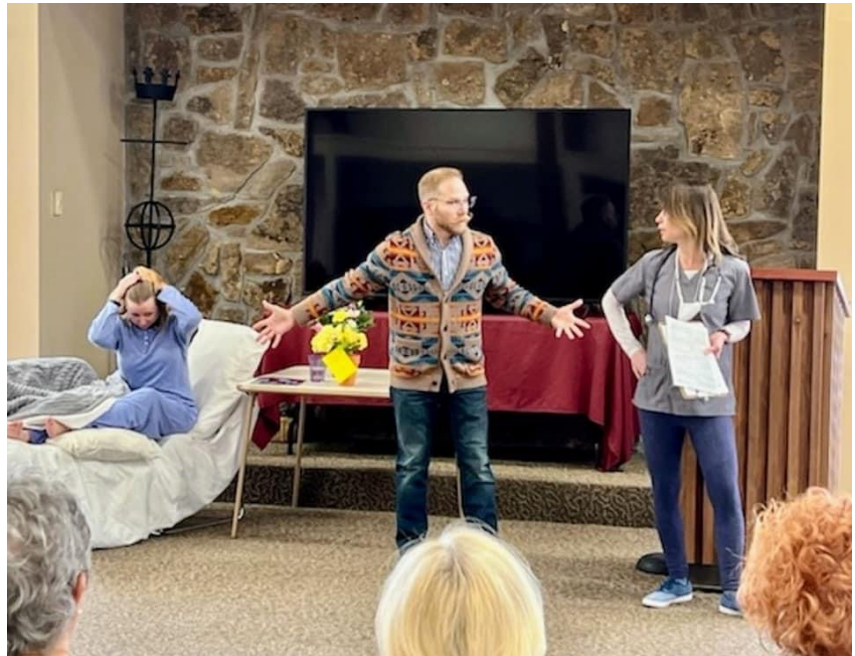
Performance of SNL skit Mr. Short term Memory , episode “The Hospital”