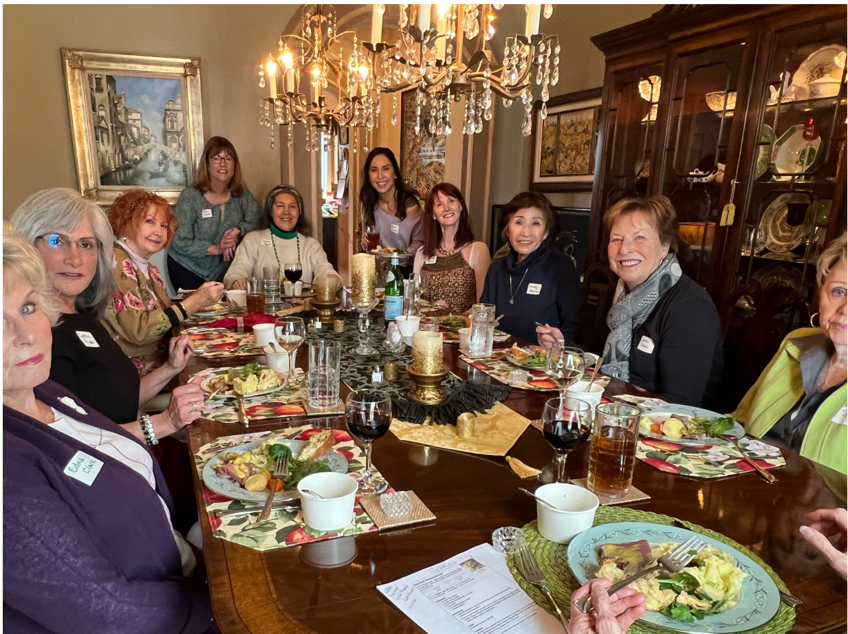
Enjoying an Irish themed menu at Ladies Gourmet