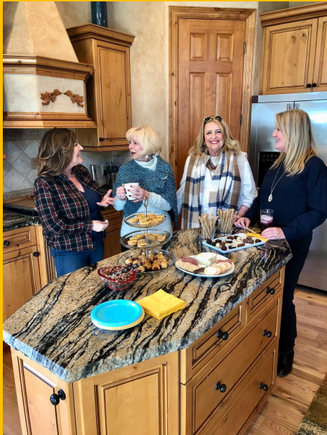
Friends, Food, and Fun, oh my!