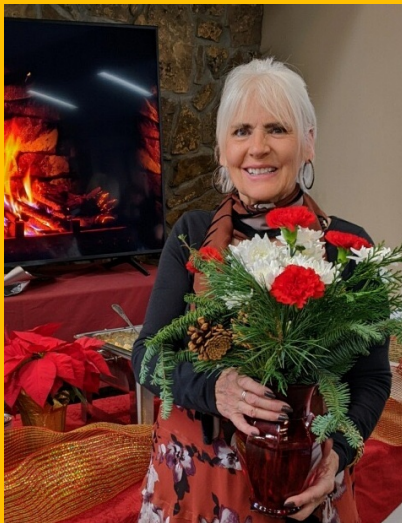
Merrily wins the Skyway Flowers