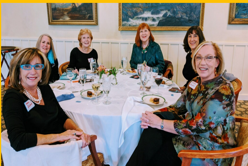
Attending a CMNC Fashion show at Cheyenne Mountain Country Club