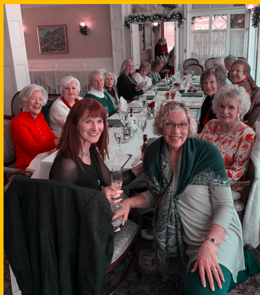
Mexican Train and Canasta at Cliff House