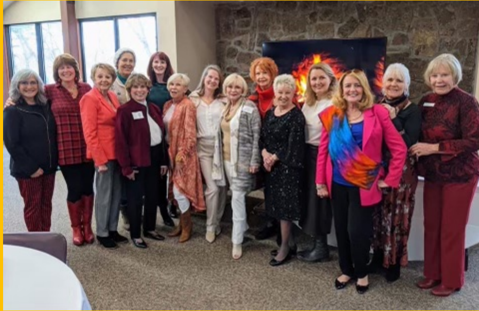
A few of our radiant CMNC Ladies after they have enjoyed entertainment, socializing and a lovely lunch.