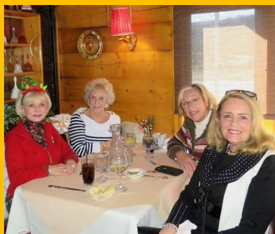
Decorating Divas at the Swiss Chalet