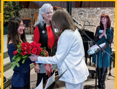
Presentation of Red Roses for Kaiya