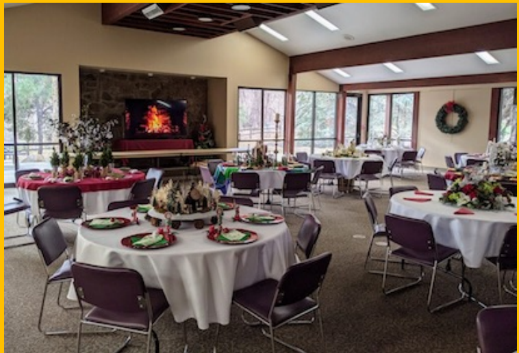
Thank you Activity Ladies for the beautiful table settings year after year!