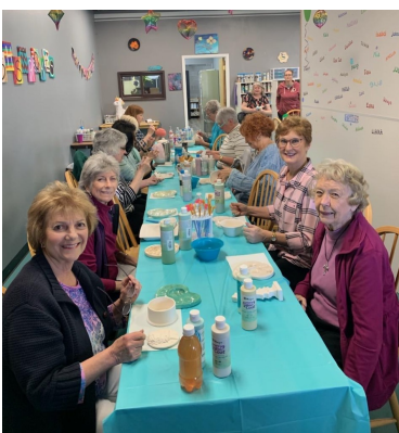
Painting Pottery with the Decorating Divas is fun!