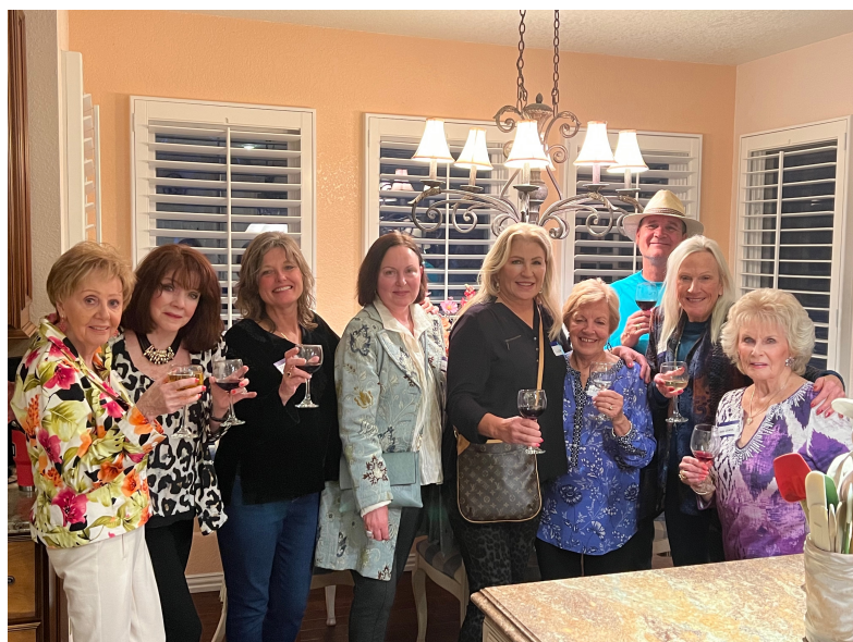
Wine and Friends raises a glass to CMNC!