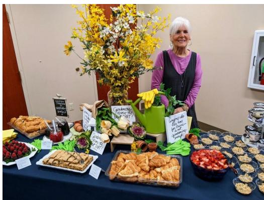
Merrily & Nurturing Ladies, nurture us!