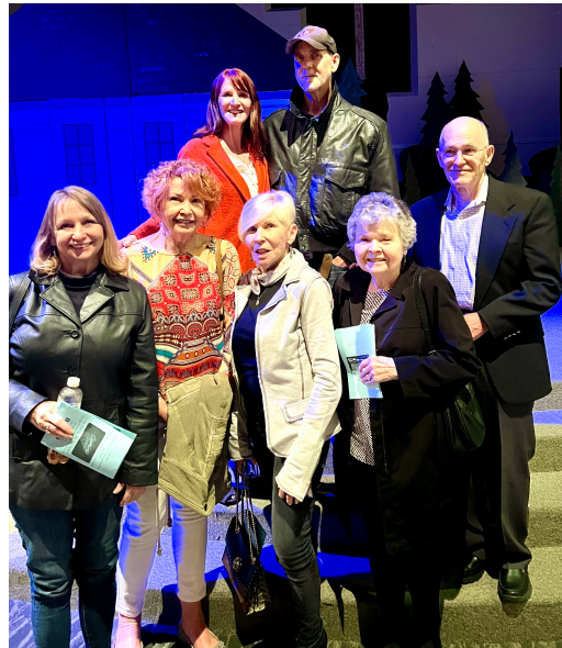
Theatre Club (Drama Queens) pause for a photo after the show.